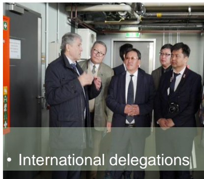
• International delegations