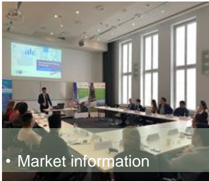
• Market information