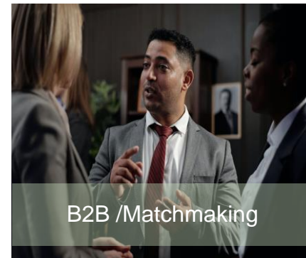
B2B / Matchmaking