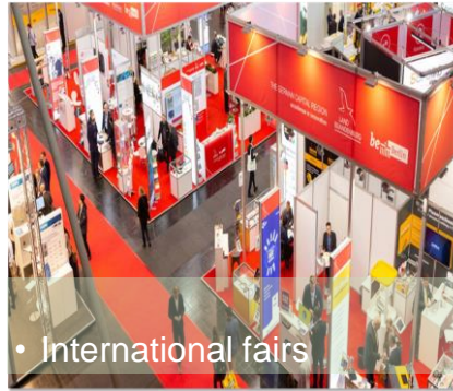
• International fairs