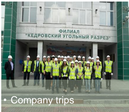
• Company trips